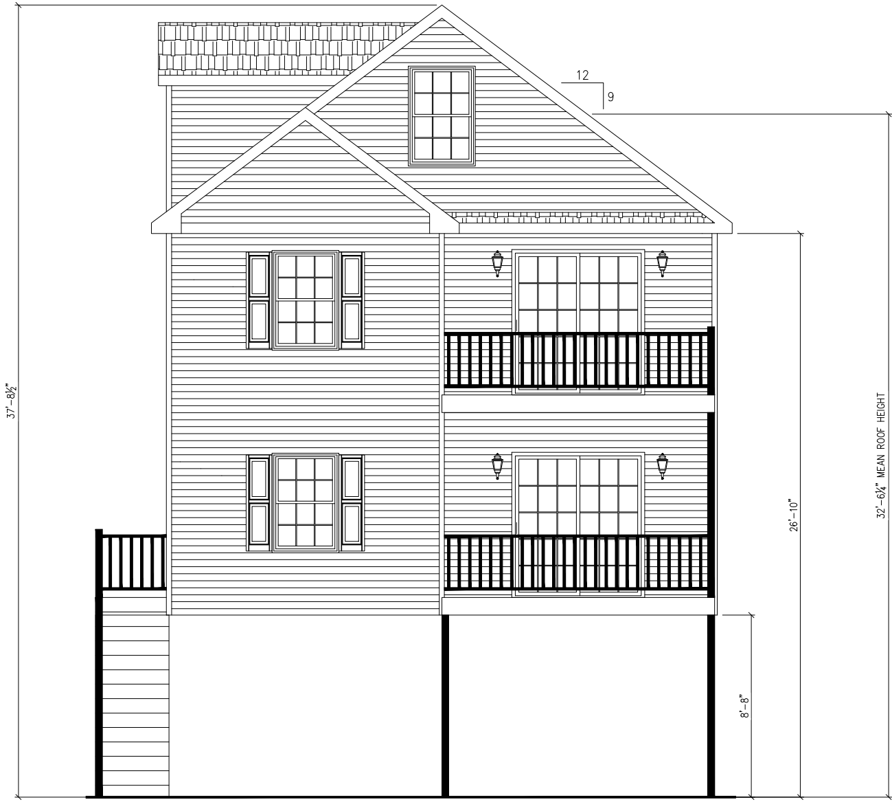
FRONT ELEVATION ACCESS TO GRADE ON-SITE BY OTHERS

THE BFE IS 16' WE ARE SHOWING 8'-8" ABOVE GRADE BUILDER CONFIRMED GRADE LEVEL IS 9' ABOVE SEA LEVEL