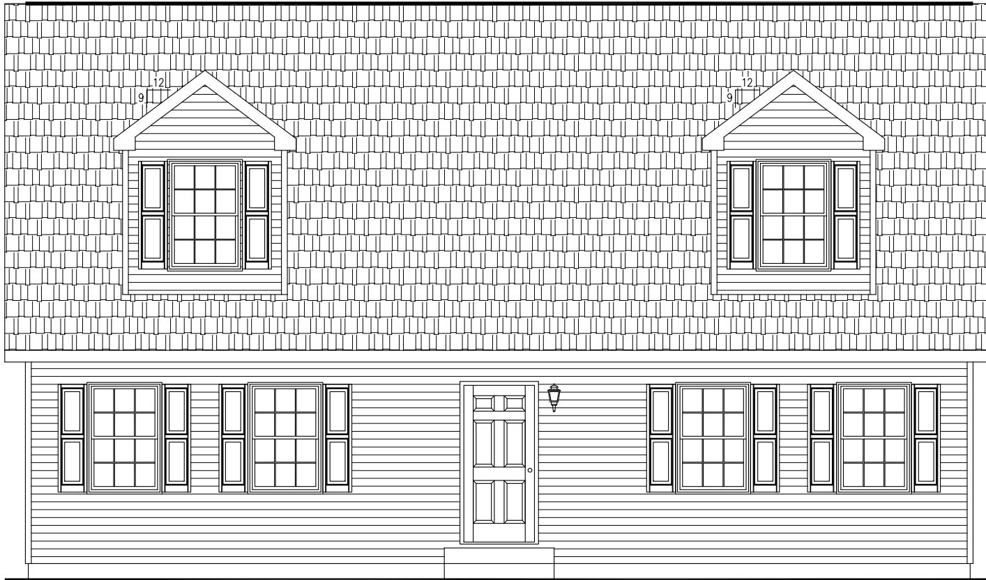
FRONT ELEVATION ELEVATION SHOWN WITH OPTIONS