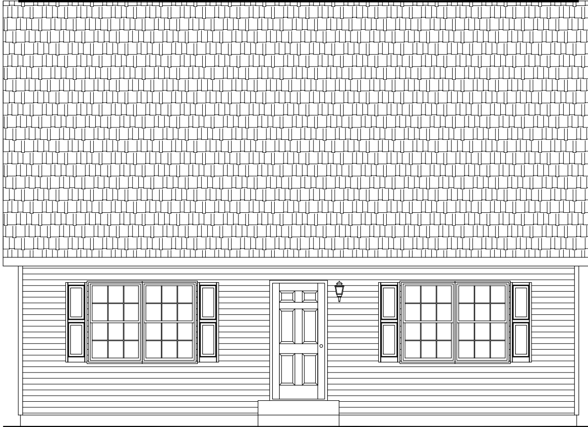
FRONT ELEVATION ELEVATION SHOWN WITH OPTIONS