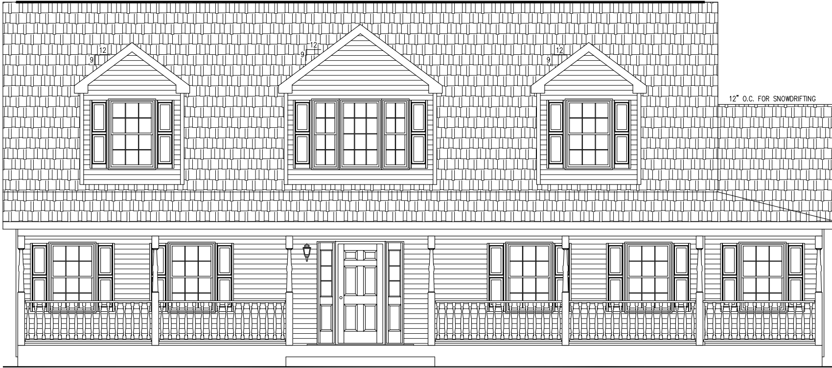
FRONT ELEVATION ELEVATION SHOWN WITH OPTIONS

Icon - Legacy Custom Modular Homes, LLC 246 SAND HILL ROAD SELINGROVE, PA 17870 PHONE 570-374-3280 FAX 570-374-1122 WWW.ICONLEGACY.COM