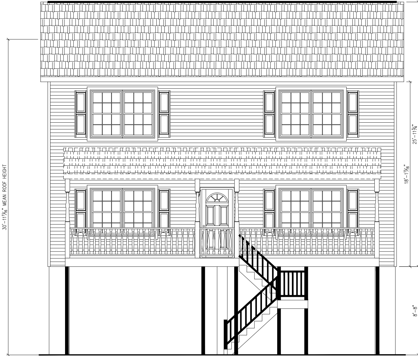
FRONT ELEVATION ON-SITE PORCH AND ROOF ACCESS TO GRADE ON-SITE BY OTHERS

THIS BUILDING HAS BEEN EXTRACTED FROM AN APPROVED SYSTEMS OR PER MODEL APPROVAL