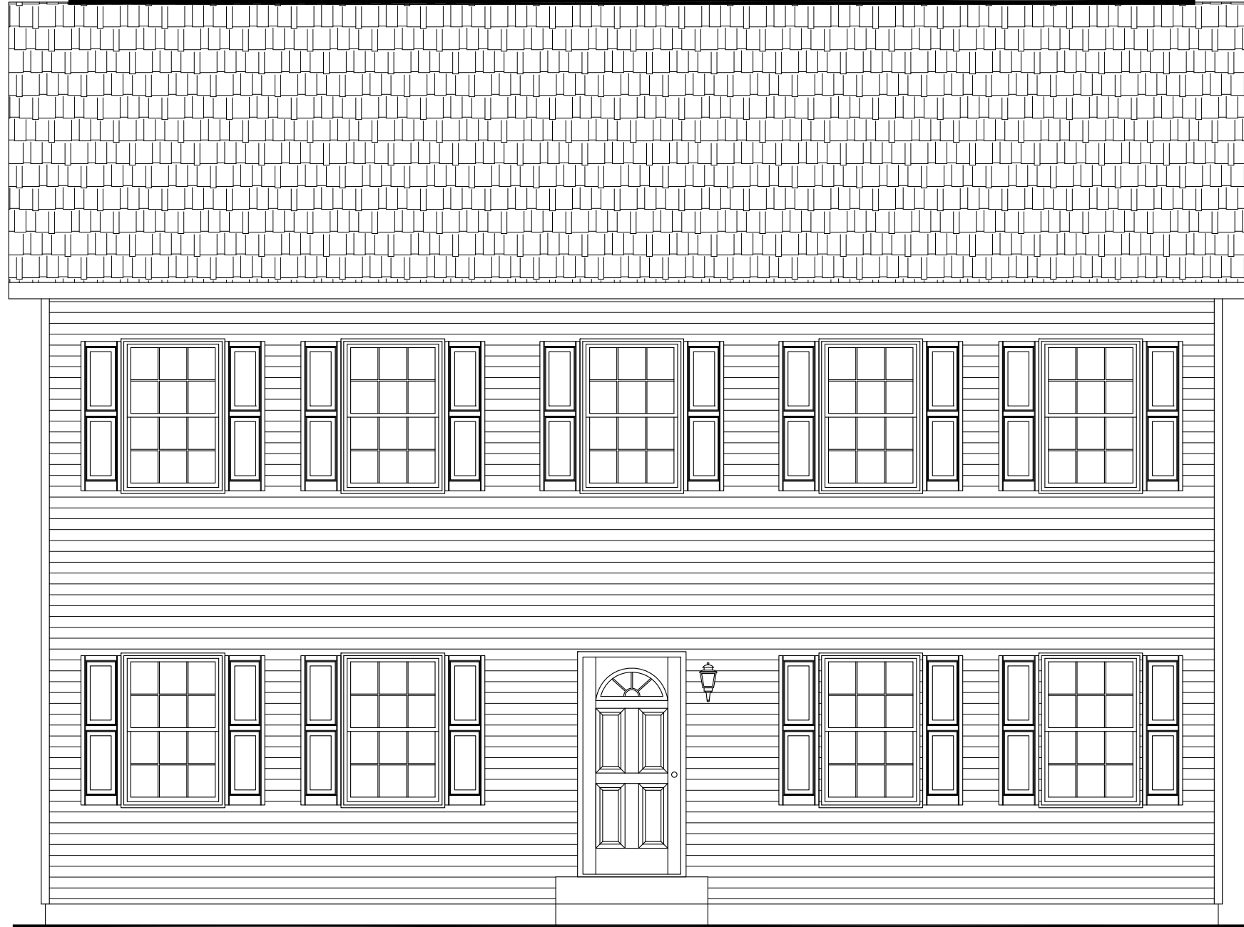
FRONT ELEVATION ELEVATION SHOWN WITH OPTIONS