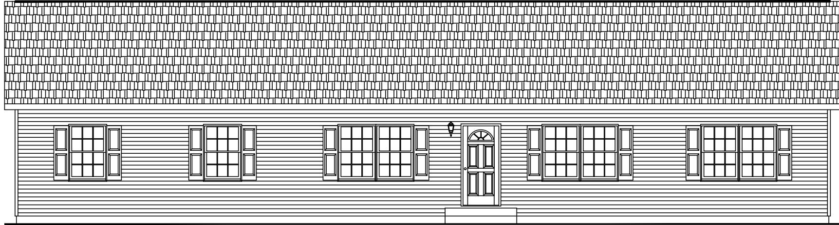
FRONT ELEVATION SHOWN WITH OPTIONAL WINDOW GRILLS